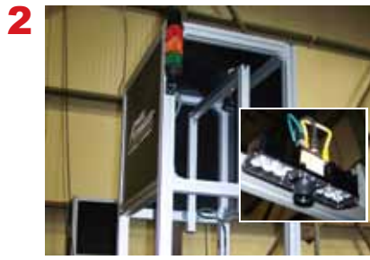
2 Barcode is scanned.