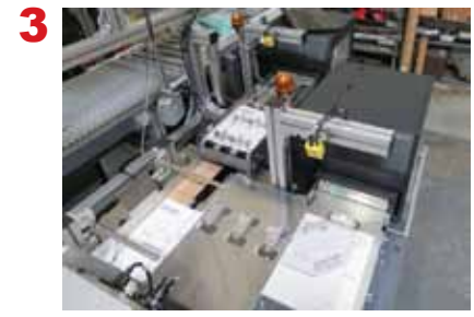
3 Dual packslip printers increase uptime.