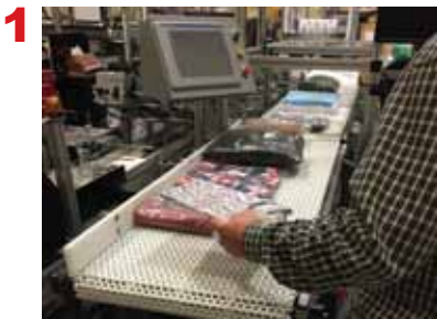
1 Product is placed on infeed.