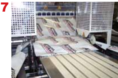
7 Package is wrapped and sealed to form mailer.