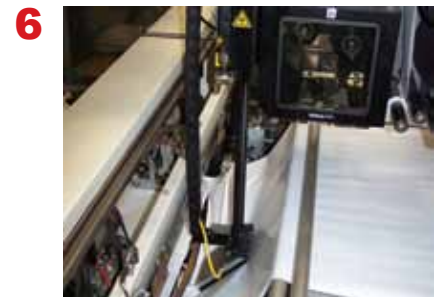
6 Shipping label is printed and applied.