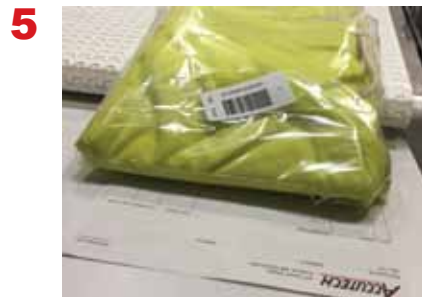
5 Paperwork and product are combined.