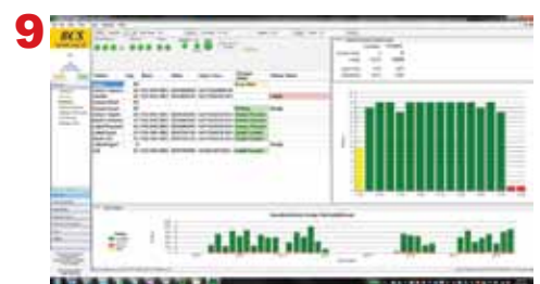
9 Extensive reporting throughout the process.