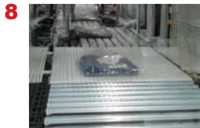
8 Right-size package for reduced DIM and shipping cost.