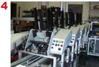
4 Order-specific marketing collateral is automatically selected.