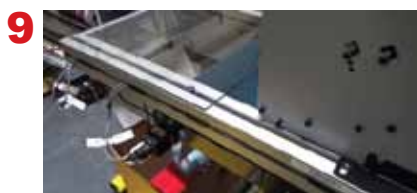
9 Customer-specific collateral inserts are dispensed into box.