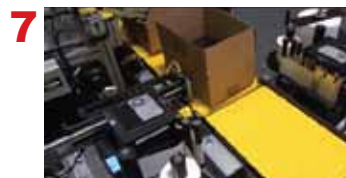
7 Content label is printed, applied to box and verified.