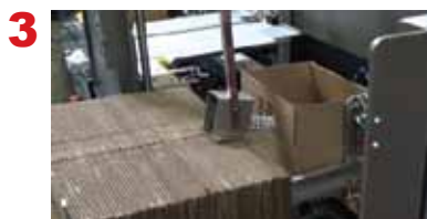
3 Box is erected and bottom is taped.