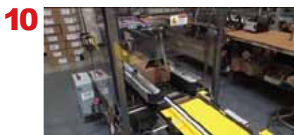
10 Box flaps are closed and taped.