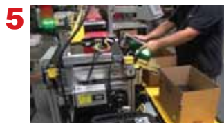
5 Operator #2 loads product into cartons.