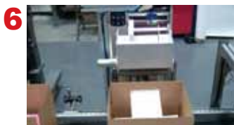
6 Packslip is printed, verified and inserted into the box.