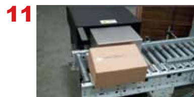
11 Reject station: Box is diverted for wrong shipping label or cancelled order.