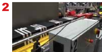
2 Operator #1 loads product to be packed onto the infeed conveyor.