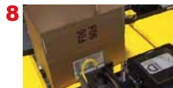
8 Shipping label is printed, applied to box and verified.