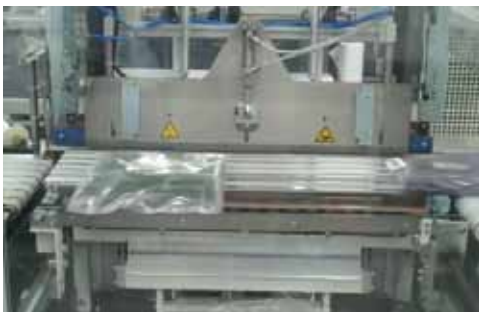
Adapta feature right-sizes bag width for proper merchandise presentation.