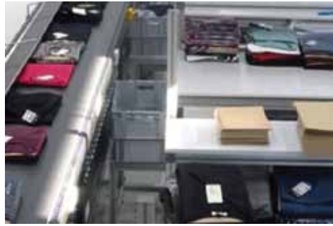
Merchandise is then prepared with price ticket facing up and placed on upper in-feed conveyor.