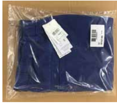
Path of merchandise is communicated through different labels.