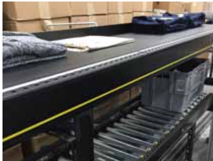
Returned merchandise arrives in a tote on the bottom conveyor.