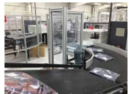
Wrapped, labeled merchandise is conveyed to forward pick locations or back into stock.

The Returns Processing System makes handling returns easier and more efficient, presenting merchandise as good as new!