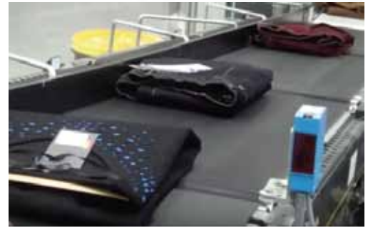
The system spaces the merchandise and the camera scans the price ticket to gather label information.