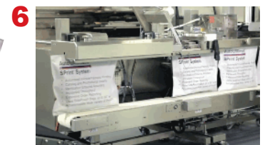
Mailer is sealed with 3/8" heat seal and then exits the system.

Please contact us if you would like to learn more about this system.