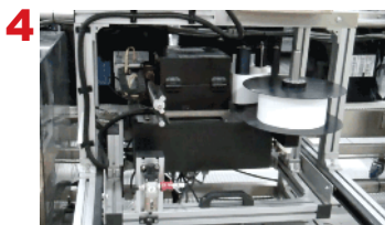
Shipping label is printed and applied to the mailer.