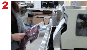
Packslip prints and drops into mailer automatically.