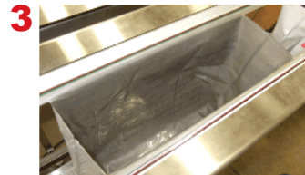
Operator loads merchandise into pre-opened mailer.