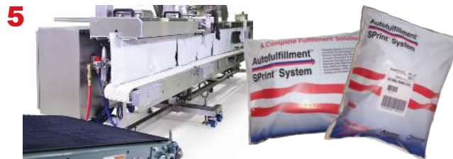
Seal flattener ensures a wrinkle-free, secure seal.