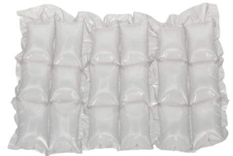
Extreme Grade High-Performance Inflatable Cushioning (Quilted) - Inflated