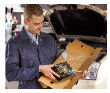
Shown: Korrvu retention package for automotive part