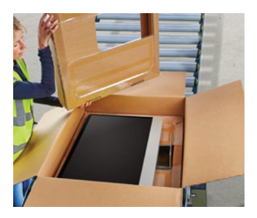
Shown: Oversized Korrvu suspension package for television

• Uses film to secure the product to a corrugated board, keeping it from shifting during transit