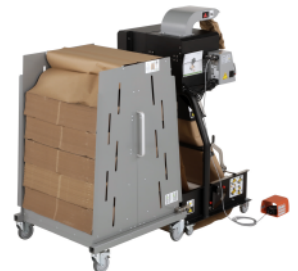
Shown: ProPad paper cushioning system with optional fanfold paper cart