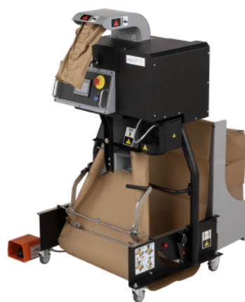
Shown: ProPad paper cushioning system with fanfold paper

The SEALED AIR® brand paper cushioning system increases fulfillment velocity with custom-length paper produced at up to 150 pads per minute, making it the fastest paper cushioning system on the market. It dispenses in manual, auto-repeat, and sequence modes to help meet your productivity goals, and is ideal for use in cushioning, wrapping, and blocking and bracing applications.