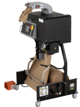
Shown: ProPad paper cushioning system with paper rollstock