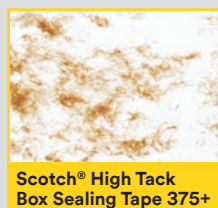
Scotch® High Tack Box Sealing Tape 375+