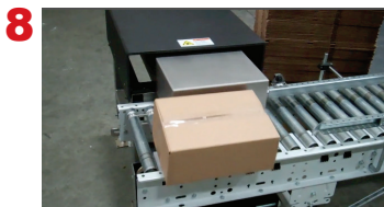
Reject station: Box is diverted for wrong shipping label or cancelled order.