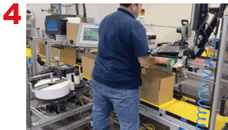
Operator #2 loads product into cartons.