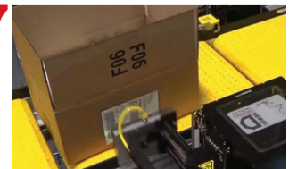
Shipping label is printed, applied to box and verified.