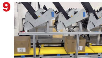
Customer-specific collateral inserts are dispensed into box.