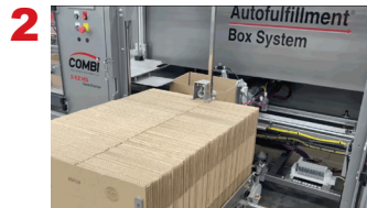
Box is erected and bottom is taped.