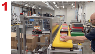
Operator #1 loads product to be packed onto the infeed conveyor.