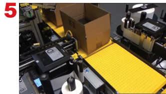
Content label is printed, applied to box and verified.