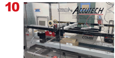
Box flaps are closed and taped.

Please contact us if you would like to learn more about this system.