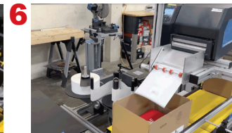
Packslip is printed, verified and inserted into the box.